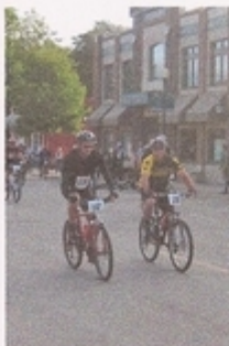
air-up those tires BIKE 20.0 miles