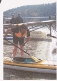
grab that paddle KAYAK 5.5 miles