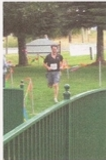
put on your sneakers RUN 5.3 miles

The Rathdrum Adventure Race is sponsored by