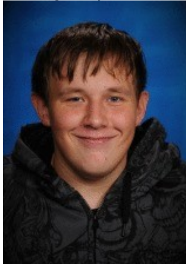
8 th Grade