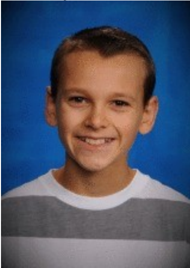
8 th Grade