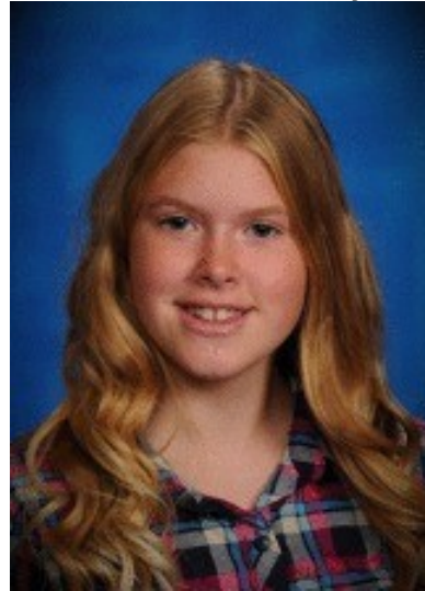
8 th Grade