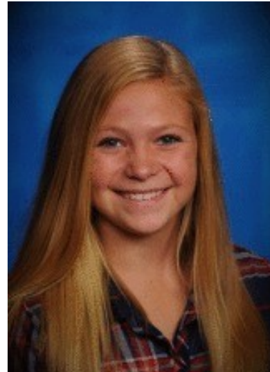
7 th Grade